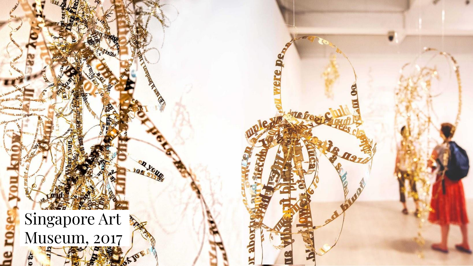
Singapore Art Museum, 2017