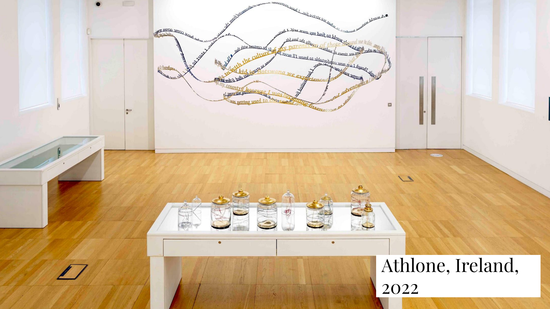
Athlone, Ireland, 2022