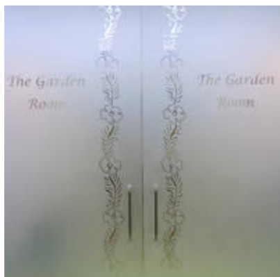
Garden Room Door Design

News from our members and details of forthcoming events.