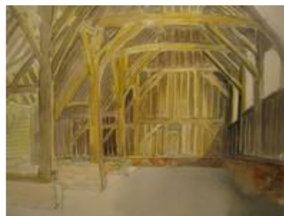
"Kingsbury Barn" Susan Llewelyn-Elvidge

"Beautiful exhibition with some really fantastic work - such a high standard".